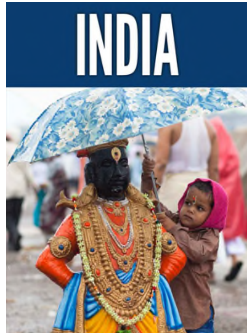
India Startup Guide