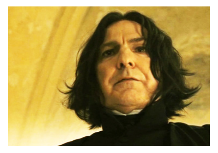
Click on the image to view this clip.

Most sources of stress are easy to identify. If your nonprofit is waiting to land a grant that your organization needs to function, or you are working on the biggest project of your career, you're bound to feel stress, but the unexpected sources of stress are the ones that can take you by surprise and harm your brain. Recent research from the Department of Biological and Clinical Psychology at Friedrich Schiller University in Germany found that exposure to negative emotional stimuli-the same kind of exposure you get in the presence of complainers and otherwise negative people-caused subjects' brains to have the same emotional reactions that they experienced when stressed. Your brain gets sucked into a negative emotional state when exposed to negative people, andjust like a stress response-the longer you endure this state the worse it is for your brain.