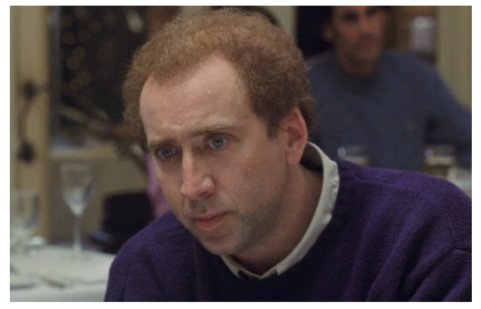
Click on the image to view this clip.

When it comes to self-talk, there are six toxic beliefs that hold people back more than any others. Be mindful of your tendencies to succumb to these beliefs, so that they don't derail your career.